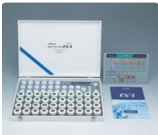
EX-3 FULL KIT PST

The fabrication procedures for NORITAKE SUPER PORCELAIN EX-3 are remarkably easy. Its outstanding features are made possible because of its very fine particle size. NORITAKE SUPER PORCELAIN EX-3 is superior to other dental porcelains because its coefficient of thermal expansion (CTE) remains stable during repeated bakings. Therefore, when making a long span bridge, each unit may be precisely customized with repeated baking of the entire span with minimal risk of cracking. It is compatible with precious, semi-precious, non-precious and silverfree alloys for metal-ceramic prostheses. Its fluorescence is ideal and it is highly resistant to silver-induced greening. This combination of features makes NORITAKE SUPER PORCELAIN EX-3 an ideal choice for porcelain restorations.