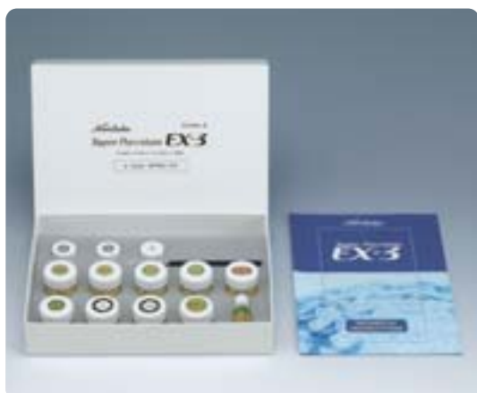
EX-3 n COLOR INTRO POBA KIT