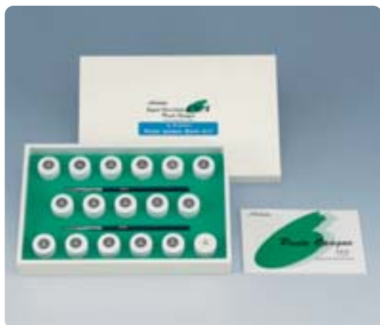
EX-3 PASTE OPAQUE n COLOR BASIC KIT