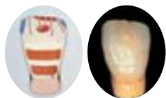
Layering scheme using IS as in the photograph.