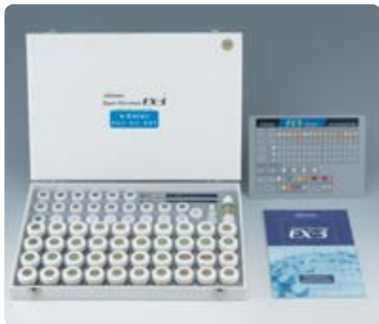
EX-3 n COLOR FULL KIT PST