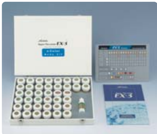
EX-3 n COLOR BODY KIT